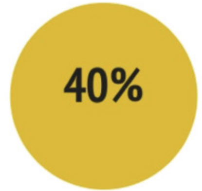
Growth Rate Monthly