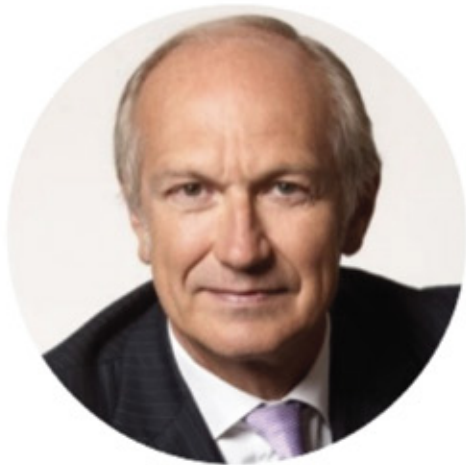
Jean-Paul Agon, Chairman/ CEO

Soon, the emerging countries of Africa will become our first market, before the US and Western Europe